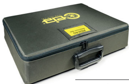
CARRY BAG [# 64082]