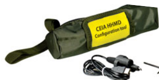
HHMD CONFIGURATION TOOL [# 63537]