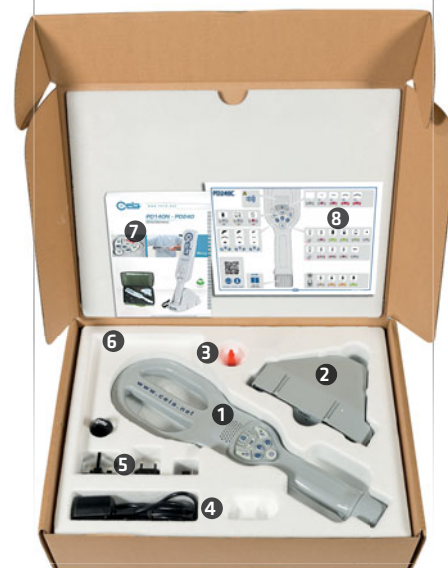
PD240CB [# PD240CB-SET]