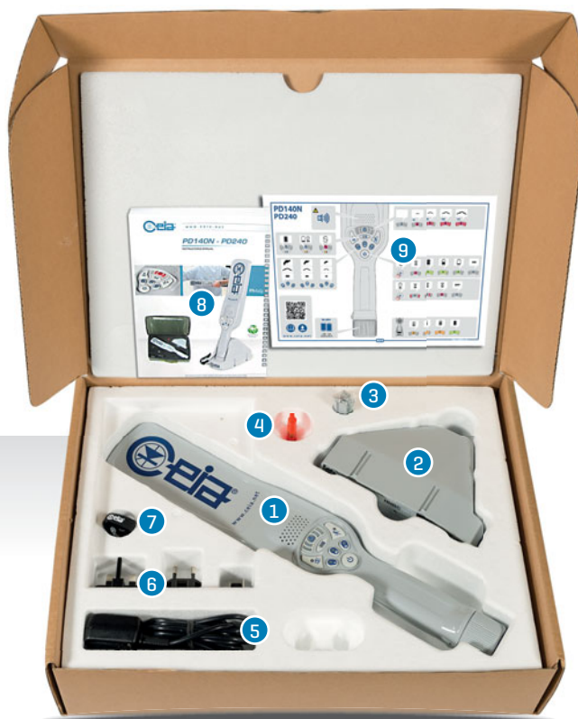
Part # PD240-Set