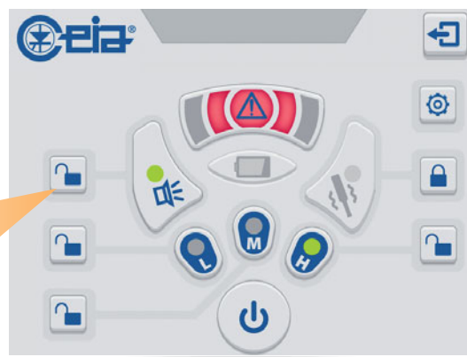
✓ Main Menu