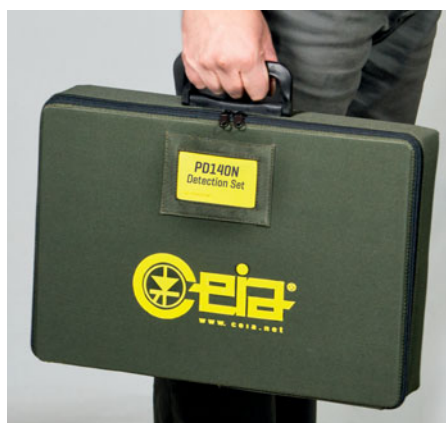
PD140N HAND HELD DETECTION SET WITH CARRY BAG